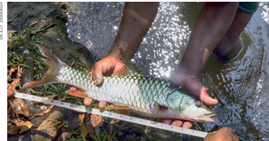
TOP The author points to the claw marks of a tiger at a staggering three metres above the ground on an Arjuna tree.

ABOVE Orange-finned mahseer caught and released as part of a mahseer survey.