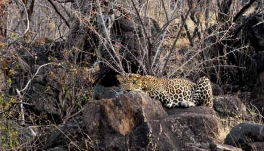
TOP The tiger observed and photographed by the author on March 14, 2016, in the Moyar valley. ABOVE Leopards live alongside tigers in these riverine forests rather successfully due to the conducive prey base and terrain.